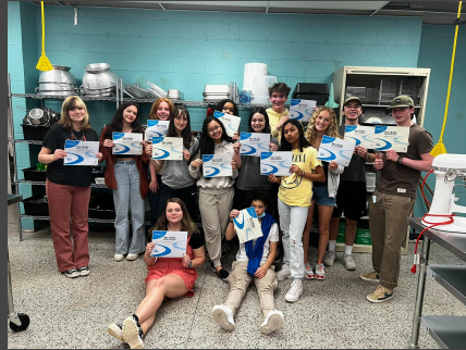
BHS Culinary 2 Students

Transylvania County Schools has been awarded a Hospitality Education Grant by the NC Department of Public Instruction. The grant provides funding for Career and Technical Education (CTE) programs designed to provide options for students outside the traditional classroom instruction with a focus on developing critical skills necessary to succeed in the hospitality sector. The grant funds will be used to expand the TCS Culinary Arts program.