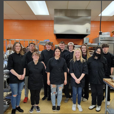
RHS Culinary Students