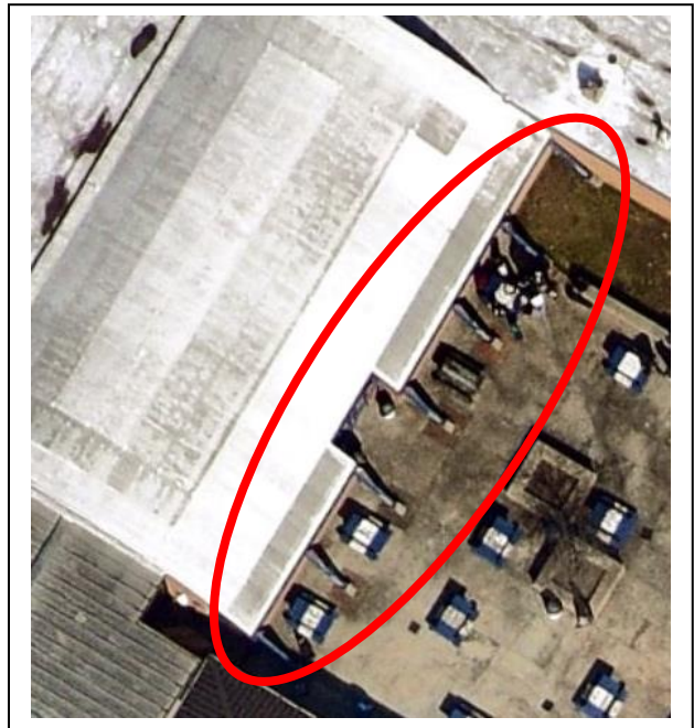
Cafeteria (7 total – all on inside courtyard side)