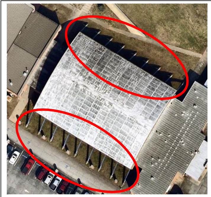
Old Gym (18 total – 9 each side)

Following is the requested proposal for work associated with the arches of Brevard High School's old gymnasium and cafeteria. Please reference the following satellite photo and pictures for additional clarification.