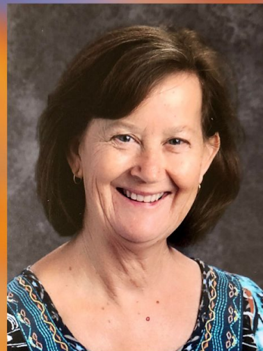
PATTY ROMAN ROSMAN ELEM