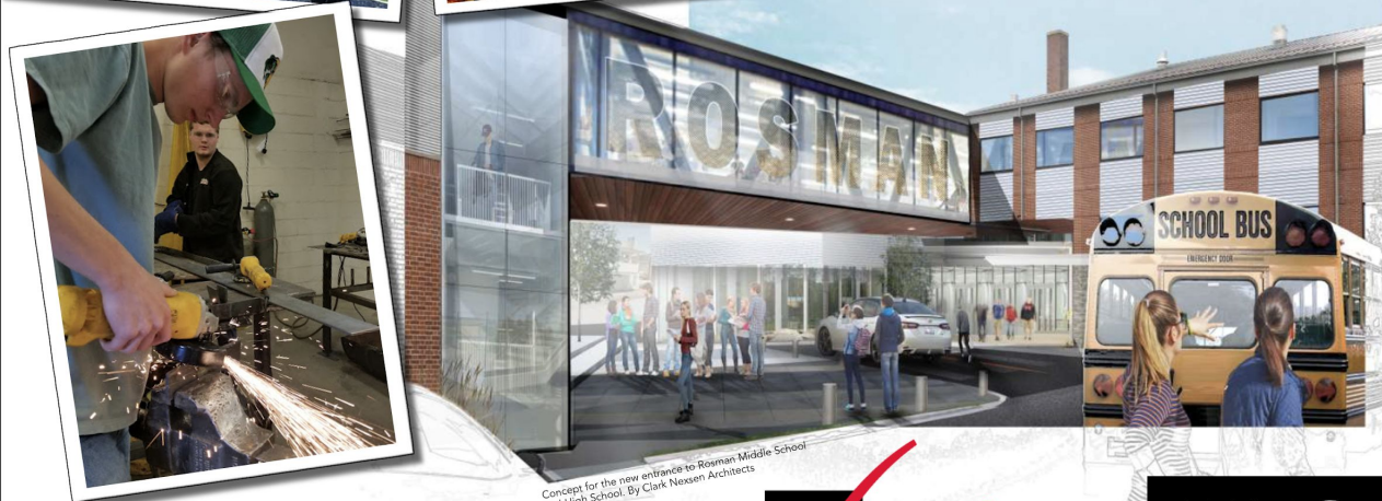
Concept for the new entrance to Rosman Middle School and High School.

Learn more from the Board of Education website: www.tcsnc.org/bond .