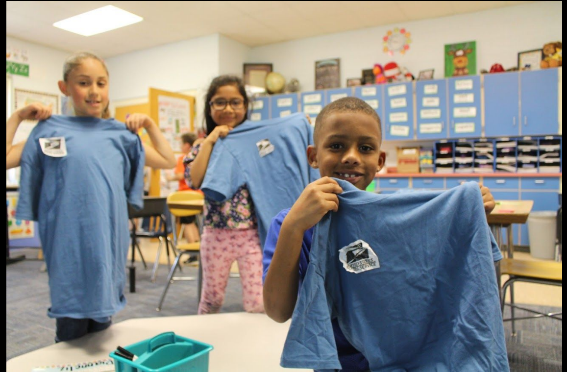
Gold Award, Photography - Main Street Economics PFE