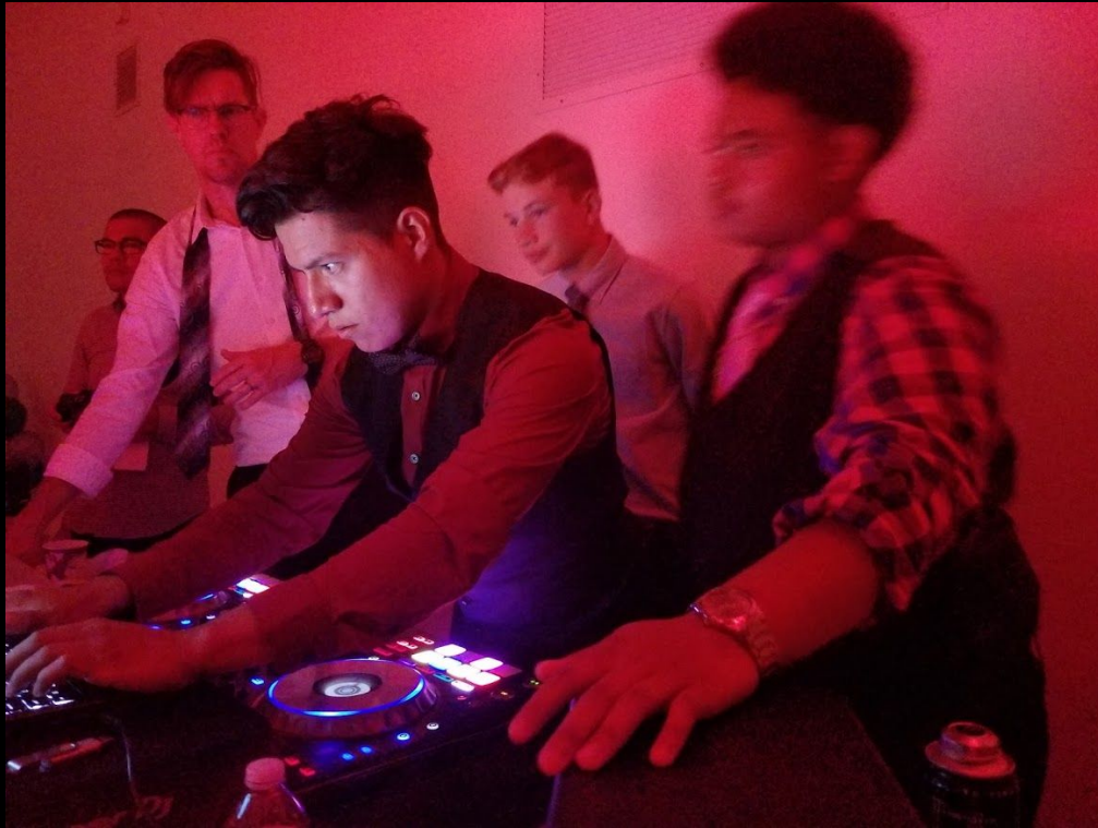
Gold Award, Photography - BHS Prom Spectacular