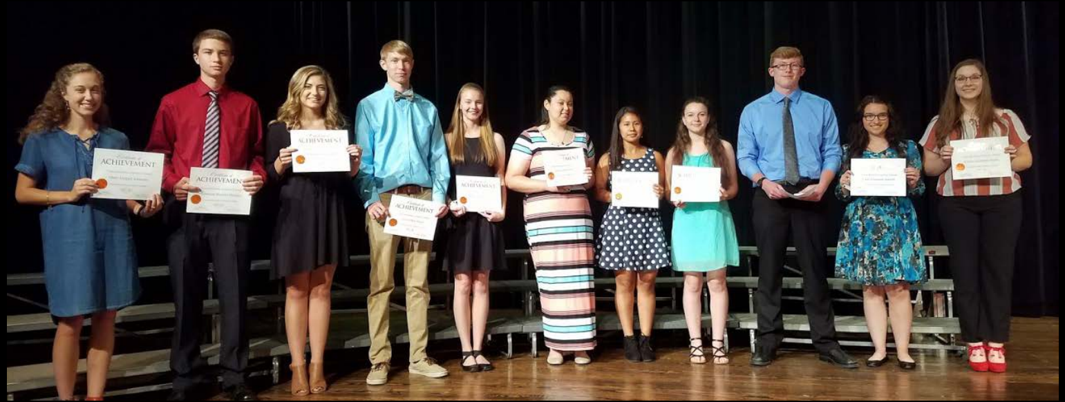
RHS Senior TC Scholars