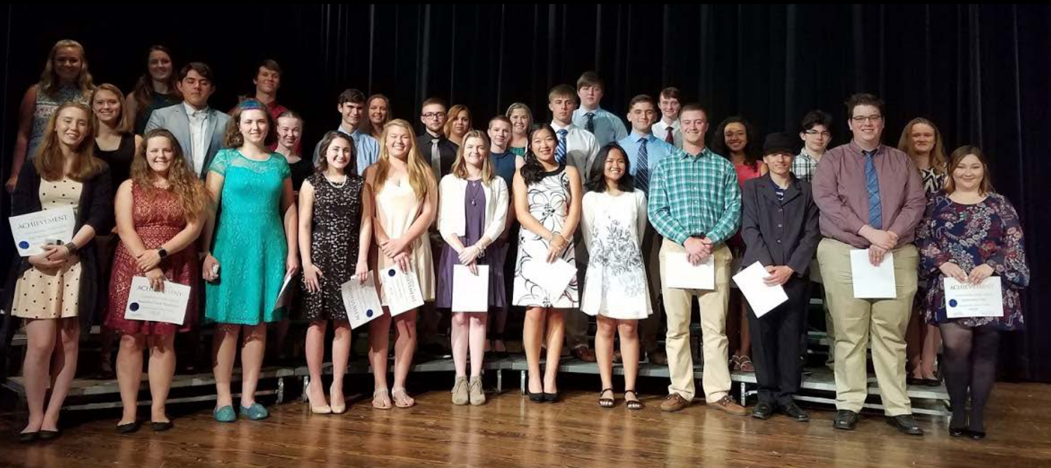
BHS Senior TC Scholars